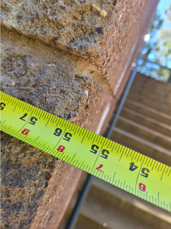
Width: Maximum of 55.75 inches