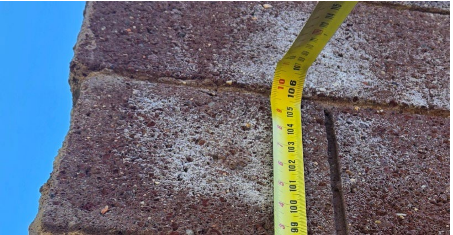
Height: 106 inches