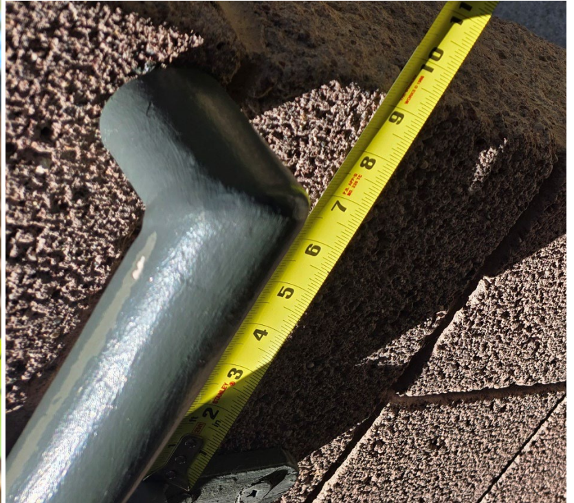
Depth: Maximum of 9 inches